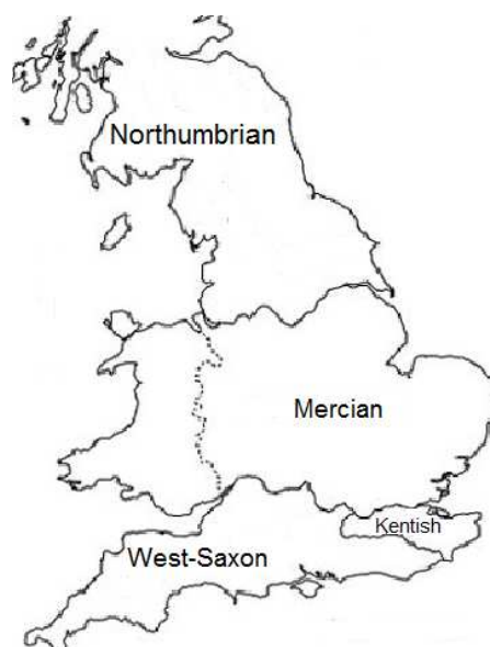
Figure 1: Old English dialects

Dialect. Four dialects of OE are traditionally distinguished: West-Saxon, Kentish, Mercian, and Northumbrian (see Figure 1); Mercian and Northumbrian are also referred to as Anglian.